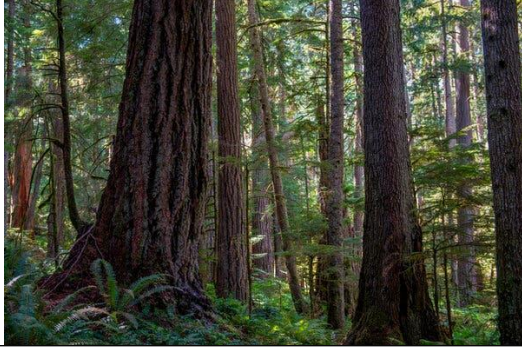
An old-growth forest in the Sol Duc Valley on the Olympic Peninsula in Washington State.

It Costs Nothing to Leave Our Trees as They Are, Carole King, guest essay, August 25, 2022. https://tinyurl.com/4w3t6su3